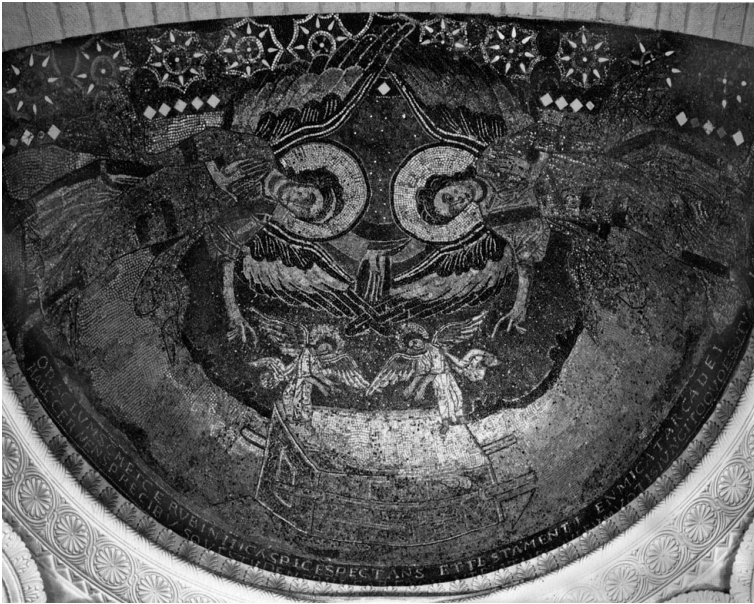
Figure 3 Germigny-des-Prés, oratory of Theodulf, apse mosaic.

ark of the covenant, which show the ark of Exodus, Theodulf's version demonstrates how the prophecies of the Old Testament, represented by the ark, have been replaced by the historical reality of Christ, whose incarnation fulfilled the promises of the old laws, and whose death and resurrection superseded them. The ark is now empty; Christ is present at the altar in the form of the eucharist. 38